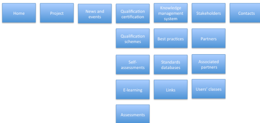
Figure 2: the map of the foreseen web pages for the project.

The main structure of the web site, which could include other functions if required by partners, is represented in the figure 2.